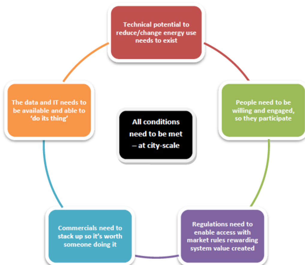
Figure 1: Conditions for Bristol's smart energy city aspiration to be realised (CSE, 2015).

Bristol's Smart City Energy Collaboration have set out the conditions that need to be met to enable sub-national smart meter data uses to be realised, across five categories of technical, social, regulatory, commercial and data (see figure 1). This demonstrates the complex number of factors that need to be realised in order for sub-national public interest smart meter data opportunities to be realised.